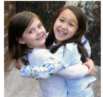
Remember when your best friend lived right next door?