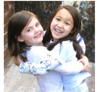
Remember when your best friend lived right next door?